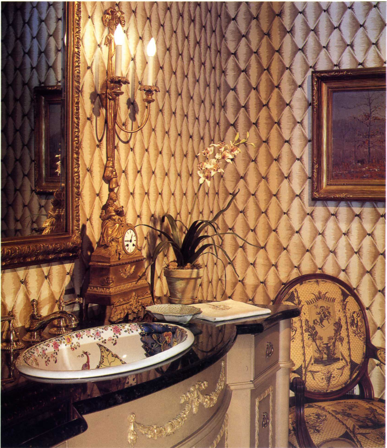
An elegant powder room with custom vanity by Wolff Woodworking and The Valley Craftsmen, and a granite counter by Hilgartner Natural Stone, is well located just off the main entry hall and the family room and kitchen corridor.